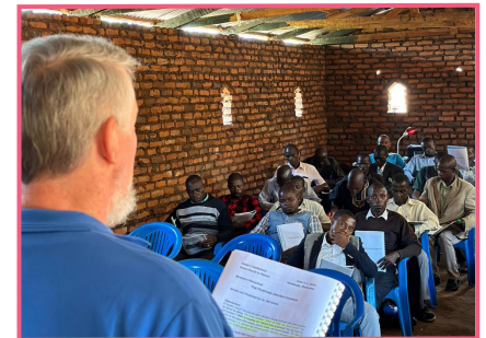
Pastors' conference at one of the three churches GMI helped to roof through donations to this Christmas project.